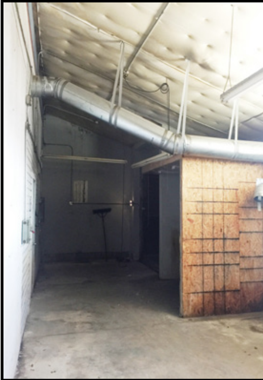
Covered Side Space