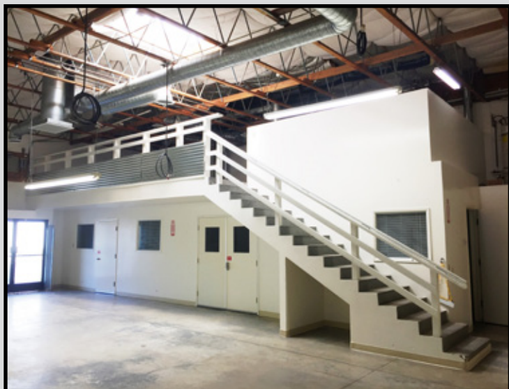
Interior Office with Mezzanine